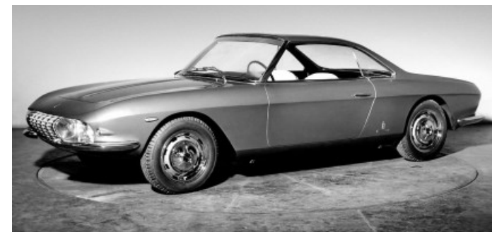
Fiat 2300S Coupe Speciale Lausanne (1964)