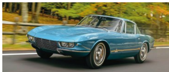
1963 Corvette Rondine

At that time, the individual design talents at large designers remained anonymous. For example, it was only later that we learned that Giorgetto Giugiaro was responsible for Bertone’s designs for the 2000 Sprint Coupe and Giulia Sprint GT. Likewise, the talented designers of Pininfarina didn’t receive individual credit for the designs they created. One of the design house’s top designers at the time was the American Tom Tjaarda, who was later credited with the Corvette Rondine and went on to design a long list of significant automobiles for a host of manufacturers. Despite the similarities in form and style, Tjaarda never claimed credit for the Alfa 2600 Speciale, and it’s unlikely that we will ever know who was primarily responsible for the design. 🍀