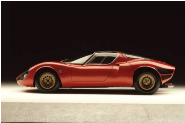
A 1967 33 Stradale, like the one that's missing

Lawyers representing the heirs of an Italian industrialist filed suit with the Milan Public Prosecutor's office alleging extortion, fraud, and misrepresentation surrounding the disappearance of an Alfa Romeo 33 Stradale, one of only 18 examples of the beautiful Scaglietti-designed masterpieces produced from 1967 to 1969.