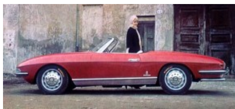
2600 Speciale Spider - 1962

There were two show cars produced by Pininfarina on the 2600 chassis. The first was a red Spider intended for the 1962 Turin and Geneva auto shows. That car was converted into a coupe for the 1963 Brussels show. The coupe was later found in the U.S. and restored to the 1963 Brussels show configuration. Both cars express the Pininfarina design aesthetic of the era. Studying the car’s profiles, one can see echoes of other cars then on the drawing boards, most particularly, the 1963 Corvette Rondine and a special built on the Fiat 2300 platform, as well other as production cars styled by the house.