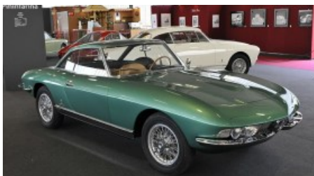
2600 Speciale Coupe - 1963

There were two show cars produced by Pininfarina on the 2600 chassis. The first was a red Spider intended for the 1962 Turin and Geneva auto shows. That car was converted into a coupe for the 1963 Brussels show. The coupe was later found in the U.S. and restored to the 1963 Brussels show configuration. Both cars express the Pininfarina design aesthetic of the era. Studying the car’s profiles, one can see echoes of other cars then on the drawing boards, most particularly, the 1963 Corvette Rondine and a special built on the Fiat 2300 platform, as well other as production cars styled by the house.