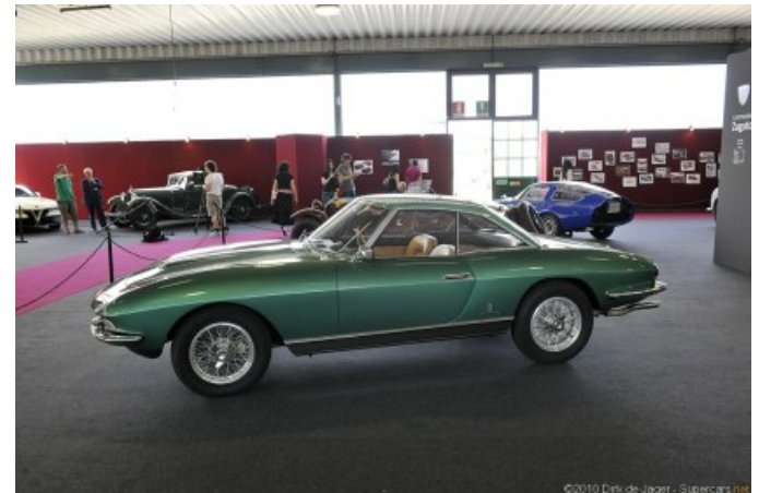
2600 Coupe Speciale