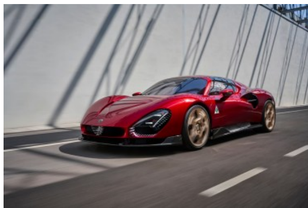
The 2024 33 Stradale, definitely not missing