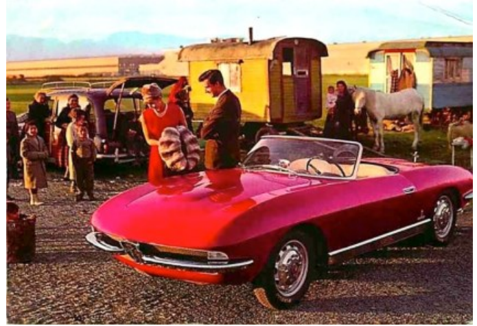
2600 Spider Speciale