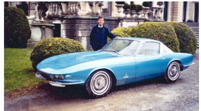
Tom Tjaarda with the Corvette Rondine sometime in the 2000s