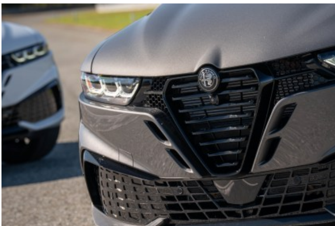
Detail of the 2026 Tonale front fascia, with new-design scudetto.

The new Tonale features refreshed exterior design and an improved interior. According to Alfa, “The 2026 Tonale’s refreshed exterior design is highlighted by a restyled front fascia featuring a concave scudetto grille inspired by the 33 Stradale and more aggressive trilobe air intakes that emphasize width and stance. Revised proportions, with a reduced front overhang and wider tracks, enhance the SUV’s athletic presence, while new 20-inch three-hole wheels with dark gray pockets, available red leather seats, and updated black-and-silver Alfa Romeo badging underscore its contemporary sportiness.” MSRP’s start at $36,995 for the Sprint. Veloce and Sport Speciale trims will also be available. 🍀