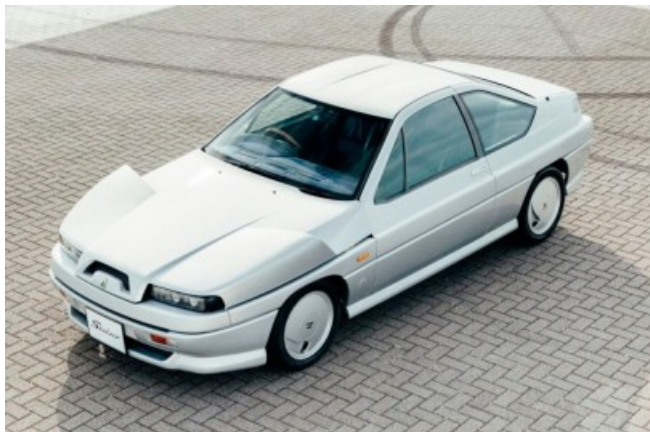
1990 Autech Stelvio Sold in the Netherlands 5/8/19 for $25,678

Tom Heinrich reacted to last month’s article about the Autech Stelvio: “I enjoyed the Autech Stelvio article and thought you might like to see a couple of Autech Zagato cars that were advertised on BAT.”