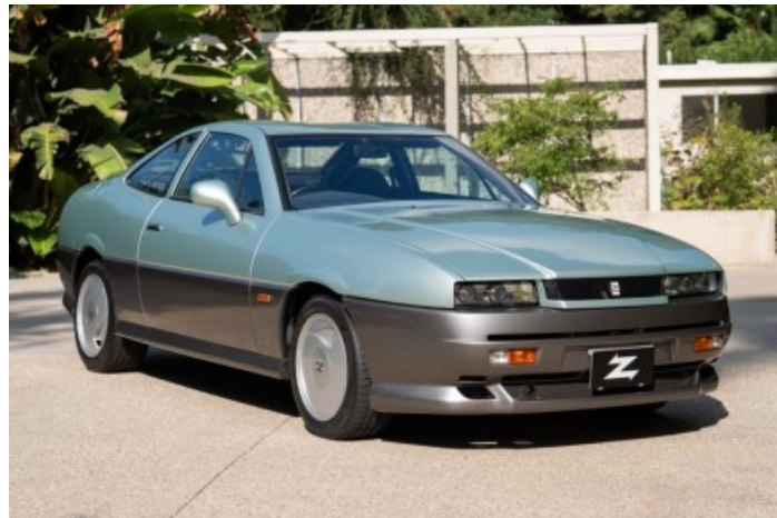
1995 Autech Gavia Sold 11/15/25 for $60,000

These are perhaps not Zagato’s best work. “It would be interesting to know where the design direction came from, the Italian side, or the Japanese side,” wrote Tom. 🍀