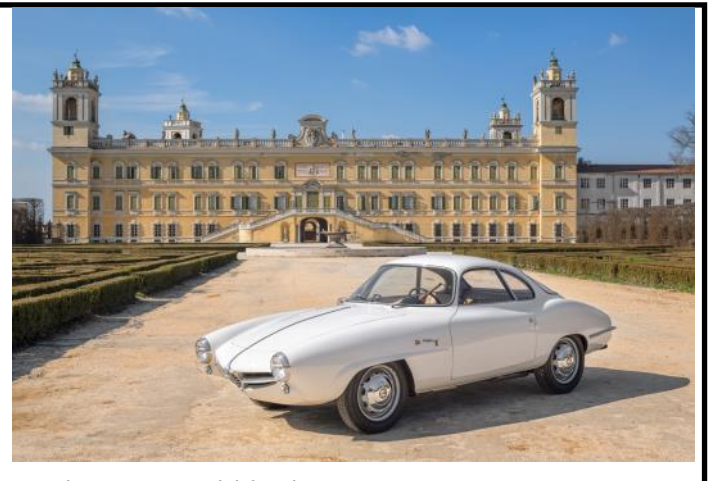
SS low-nose sold high

descended prototype to the more numerous regularproduction models.