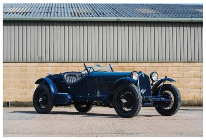
Rarely seen 6C1900

The vintage 1933 6C1900 Gran Turismo Spider #121315124 on offer sent me to my library for some research as I wasn't familiar with the model. I found