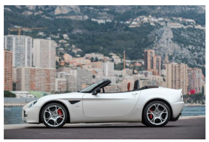
8C Spider didn't sell

Later in the auction a 2010 8C Spider , also one of 500 and with only about double the miles (4,400) on the odometer, was offered. The white (bianco madreperia) car had maroon upholstery and appeared clinically clean and tidy. The only apparent "defect" was some water spotting seen on a close-up of one of the alloy wheels. Once again, a sad case of a wonderful car going unused. Although this Spider carried the same auction estimate as the coupe ($241,000 – 301,250) the car did not sell. Wrong color? Too may miles? Hard to say.