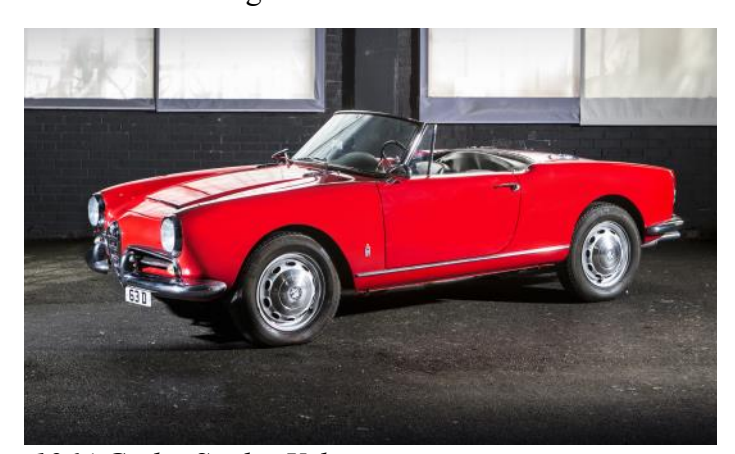
1964 Giulia Spider Veloce

The third from last lot of the auction was a 1964 Giulia Spider Veloce , AR390210. Originally a California car, it sported an older restoration. It was imported to Britain in 1995, after which the seats were reupholstered and the top replaced. The Alfa red car had black seats. The body appeared to be in generally decent shape and the engine compartment appeared correct and clean. There were some signs of wear in the interior and the recovered dash pad looked like it was coming loose at the lip. The "1600 Veloce" script on the trunk lid was present but incorrectly positioned. The Spider was last auctioned by Bonhams in Paris, February 2, 2012, for $55,563. This time the car sold for $87,834. Once again, not a bad return on investment for the consignor.