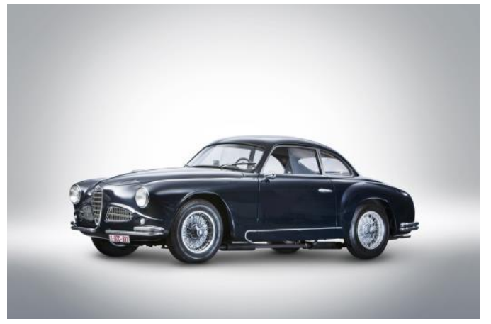
Street version of a racing 1900 coupe

Next was a 1953 Corto Gara Stradale Coupe , AR1900C 01420. This cobalt blue Touring-bodied coupe is quite rare, being only one of 11 lightened competition coupes and one of three Stradales (road cars) produced in the series. Both race and road cars were intended for competition, using some lightweight panels and plexiglass windows. The road cars added bumpers and some additional creature comforts not found in the pure racing cars. Both track and street versions had tuned engines. This car was sold originally to Switzerland, then went to Sweden where subsequently it was found in barn-find condition by a German race driver. The original engine was missing at that time.