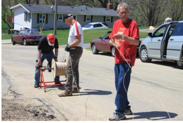
Volunteers operate the famous "Take-Up Reel D evice" during tear-down.