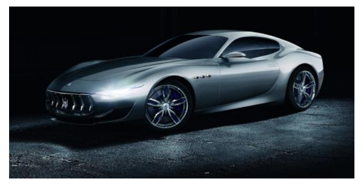
The Alfieri concept as seen in 2014

Maserati is planning to finally introduce the Alfieri, the stunning concept that was introduced in 2014.