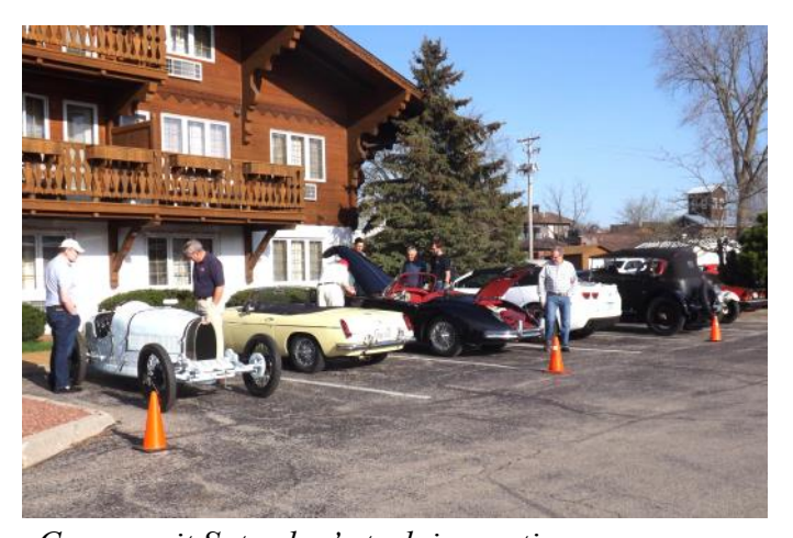
Cars await Saturday's tech inspection.

This event marked the 30<sup>th</sup> running of the hillclimb, and as in the past it was a charity event. A total of $1,400 was collected and turned over to the New Glarus High School baseball team.