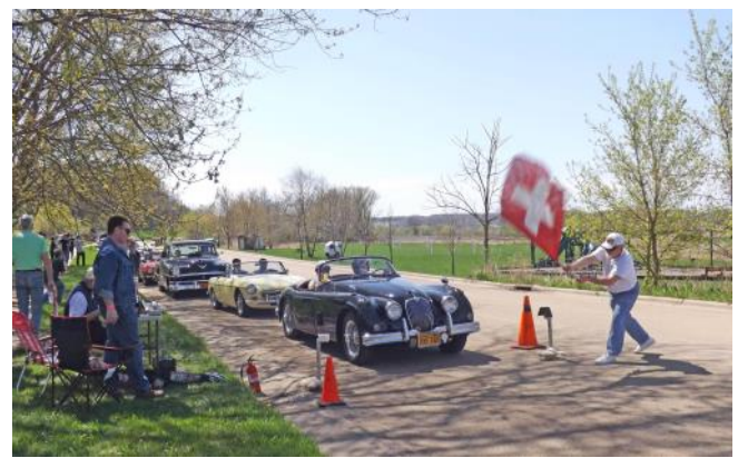
Bob Joynt's XK150 starts its run.

The sun shone down as the cars lined up for their run up the .7 mile-long hill on Kubly Road. Officially called Das Kurze Klausenrennen, meaning "The small hillclimb," the event was held on May 5 in the southwestern Wisconsin town of New Glarus.