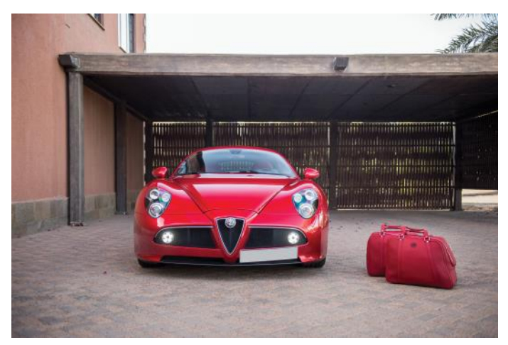
8C Competizione with luggage

It's rare to find an 8C that has been used for its intended purpose, and this one is no exception. It looks as though it has rarely left its climate-controlled garage. It seems sad that these instant collectibles (only 500 examples) are hardly ever exercised. It sold for $228,950, just below the low auction estimate.