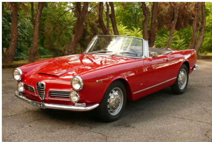
A nice 2600 for smooth roads

bare metal respray undertaken from 2016-2017. It appeared that this was a “no-issues” car and the bidders must have thought so also, as it sold for $124,695, near the top of the Bonhams estimate.