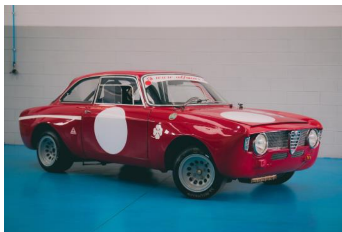
A nice GTA with later fender flares and details

Another "no sale" was a 1969 1300 GTA Junior , AR775100. This car was originally delivered in Italy and has had a known ownership since. Records exist of entries in about 20 races when the car was new, but recent outings have been limited to car shows and club events. The current owners have had the car in the family for about 30 years.