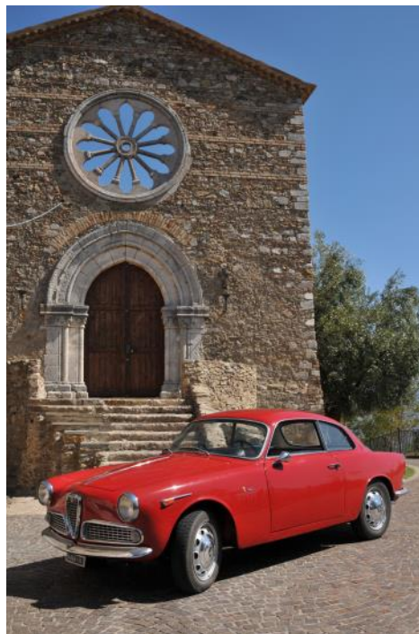
‘62 Sprint—asking too much?

A rarely seen 1953 1900C Sprint Coupe with body by Pinin Farina, AR1900C 01630, was a no-sale with an auction estimate of $410,000 - $530,000. While Touring produced several series of 1900 coupes, Pinin Farina produced only 100. This light gray Sprint with painted wire wheels and gray fabric upholstery looked very attractive, yet very sober in the auction photos. The 1900 passed through several Italian owners in Rome and Tuscany. The original engine was replaced during a 1980s’ restoration, after which the car sat unused in a private collection until it changed hands in 2014. The new owner did a refresh and interior re-trim and the car moved on to a new owner in 2015, who located and reunited the original engine with the car. There seemed to be very little to fault with this car. It could be that a certain lack of “pop” was the only thing keeping it from being sold. The high bid was $371,360.