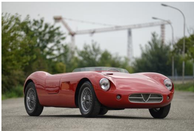
This handsome one-off evokes racers of an earlier era.

Ugo dropped the guts of a later-model Giulietta into a custom-designed tube frame and wrapped everything in a pretty aluminum body. There are appealing design touches, like the suggestion of the traditional Alfa heart in the front grille, the simple engine-turned dash with wood-rimmed steering wheel, and the intricate routing of the side exhaust. The first owner kept the car for some 35 years before passing it on to the consignor. The roadster sold at no reserve for $35,240. I'd say it was worth that money and more.