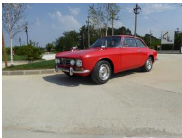
Late GTV sold for $27,107

British auction house Bonhams chose the Padua event to stage its first Italian auction, Saturday, October 28, 2017. It presented 60 lots, biased heavily toward Italian and German marques and realized $3.487 million in sales. The high sale was a 1957 Mercedes Benz 300SL roadster that sold for $1.058 million. Eight interesting Alfa Romeos were offered.