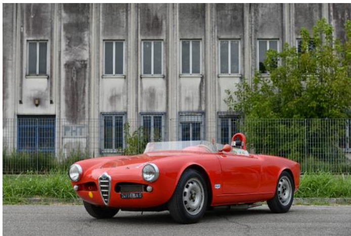
Not a real Sebring Spider, but a nice repro