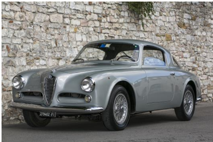
A rarely seen Pinin Farina coupe

bare metal respray undertaken from 2016-2017. It appeared that this was a “no-issues” car and the bidders must have thought so also, as it sold for $124,695, near the top of the Bonhams estimate.