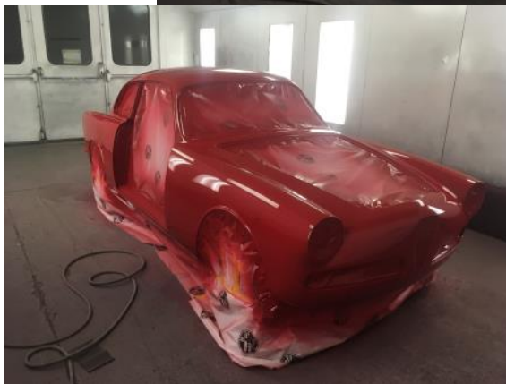
The Sprint in primer... and in paint, October 2017