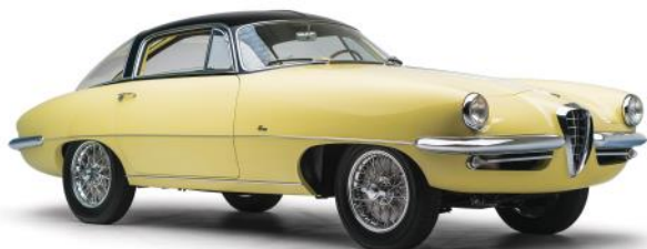
Sotheby's 1900C SS Speciale by Boano