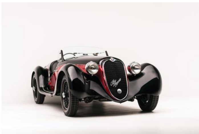
1942 6C2500 for sale by RM Sotheby's

Barrett-Jackson's success over the years has attracted other auction companies to the market. After all, the Phoenix area is a good place to be in January, especially for those visiting from less hospitable climates.