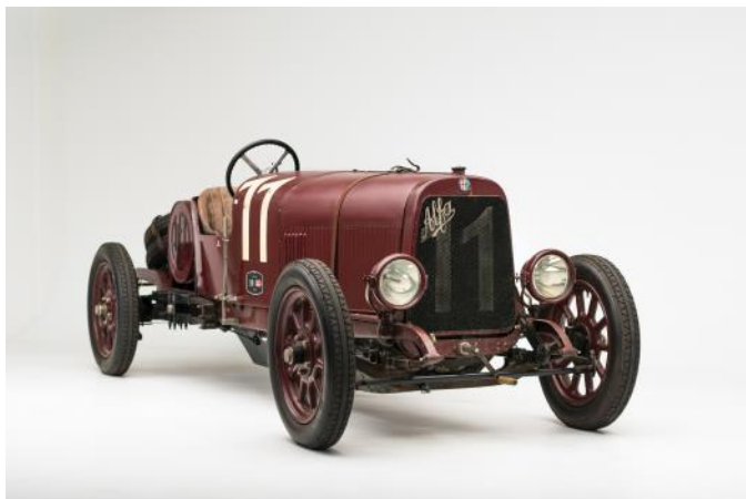
1921 G1 at RM Sotheby's

All the major auction houses doing business in the U.S. are represented at Scottsdale except for Mecum , who will be presenting its ten-day stand in that other haven for snowbird car collectors, Kissimmee, Florida, January 5–14.