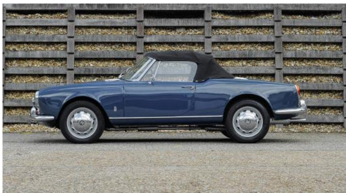
All-original Canadian Spider

The Bonhams Chantilly sale included a blue 1963 Giulia Spider with white upholstery and a factory hardtop. The car was originally delivered to North America and spent the majority of its time in Canada. It was under the care of a single owner since 1981 but is now in the U.K.