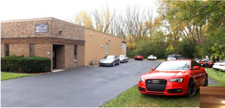
The JWS Classics building