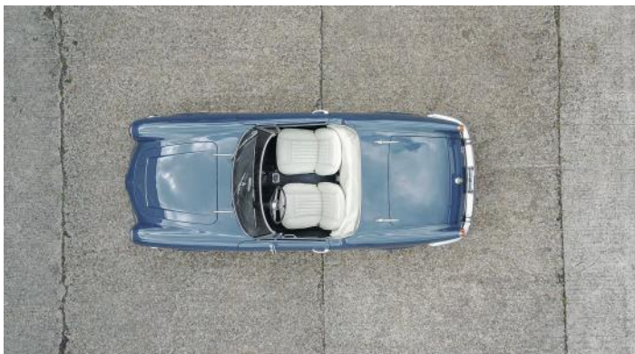
A nice camera angle for the Spider

1969 GTVs. The seats in this car are the ones we saw on later cars. They are, however, listed in the parts book as available in later-production cars so they are probably correct. The door trim appears to be a mix of earlier and later elements. I also thought it unusual to see rubber mats instead of carpeting. The wood-rimmed Hellebore steering wheel looks handsome and overall the interior looks inviting, although there is some light pitting on the dash trim. The sill plates show the usual scratching from use and the engine compartment is driver-level. A close-up of the serial number on the firewall suggests the car's original color may have been white. The sale price was a very reasonable $36,629.