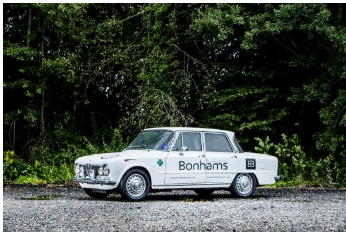
The Bonhams Super

“Bollo d’Oro.” I was especially attracted to this Super because it has the same color combination of bianco spino with red upholstery as the one sitting in my garage. What my Super fortunately lacks, however, are the bold Bonhams logos festooned on this car’s flanks. For the uninitiated, bollo d’oro refers to the stylized gold cross and serpent logo attached to the C-pillars of this series.