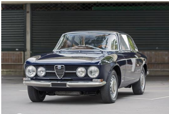
Bonhams 1969 GTV

Alfa Romeos continue to be popular in auctions both in the U.S. and overseas. Blue chip cars from the thirties have always been prized, and the 6C2500 and 1900 series cars seem to be coming to auction more often. The later cars are becoming increasingly visible. Some have suggested that the introduction of new Giulias and Stelvios in the U.S. may have increased interest in the earlier cars, while in Europe, the stock of presentable late 50s through early seventies Alfas seems to have improved over the years. It's a good time for both buyers and sellers in the present Alfa market. 🍀