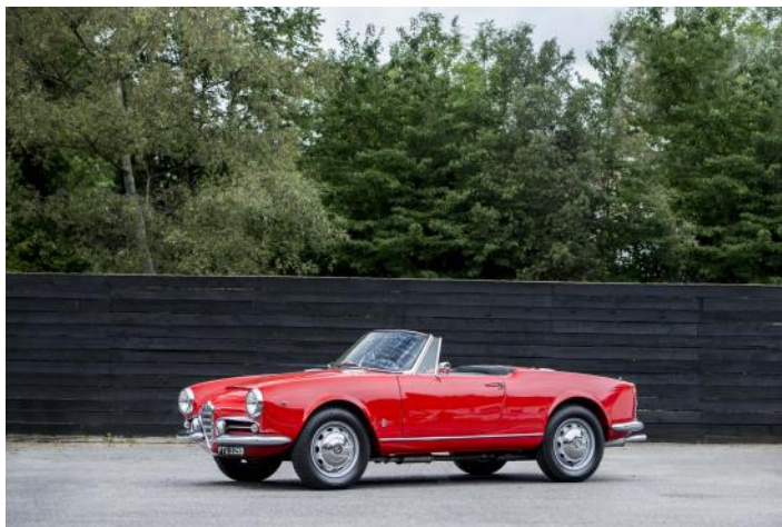
The Bonhams Goodwood Spider Veloce

The other Alfa offered by Bonhams at Goodwood was a 1964 Giulia Spider Veloce with a suggested 22,170 km (13,302 mi) from new. The low mileage was not strictly documented, but was suggested to be correct based on some correspondence that came with the car. The Spider originally resided in Italy and at