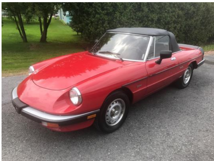
This '86 Graduate sold for $13,750

Finally, another red/black Spider, this one a 1986 Graduate showing 47,143 miles on the odometer, was offered. There appeared to be nothing special about this car, but on the other hand nothing appeared seriously out of order either. The interior was clean and seemed appropriate for a 47,000-mile car. The glove box door was slightly warped and an aftermarket radio was installed. The carpeting was protected by generic floor mats. It was hard to judge the exterior finish from the photos provided but the convertible top looked sound and had a clear rear window.