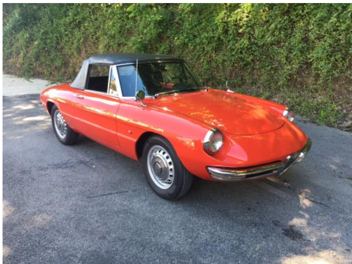
This nice, useable Duetto brought $42,350.

and an aftermarket rear bumper guard. The seat upholstery looked nicely worn in and it appeared that the correct rubber mats were installed rather than carpeting. The engine compartment deviated somewhat from original with black-plated cam cover and cylinder head bolts. Although the car was billed as a 1966 model, the title read 1967—not all that unusual for these cars. All-in-all an honest looking, usable Spider.