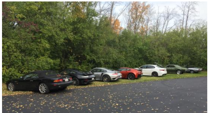
The JWS parking lot also contained some fun cars.

The cars on hand, mostly American classics, appeared to be in excellent condition. I noticed a very nice '60s Corvette and a late '50s Chrysler convertible. The weather that day was very good for October, and the member cars outside were almost as interesting as the cars inside on display.