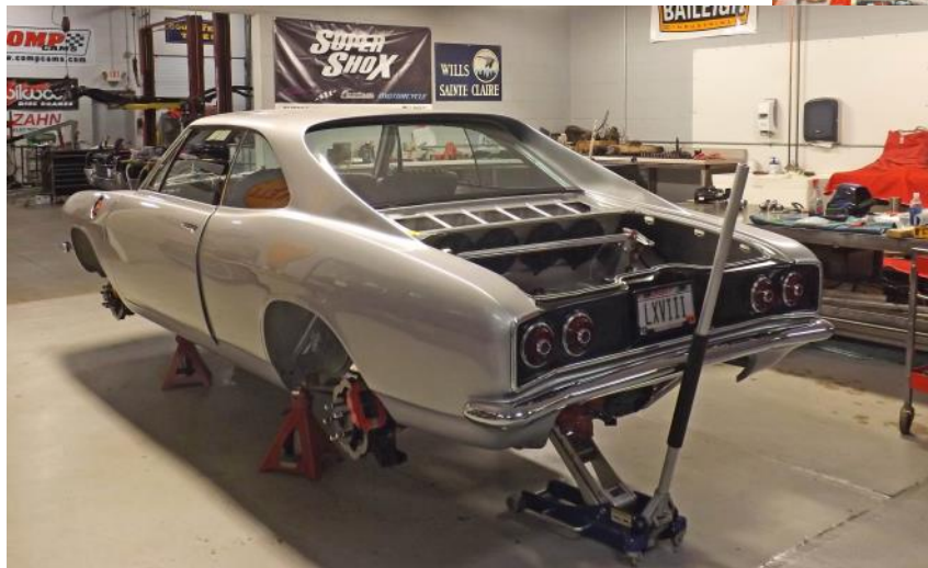
Left - Valenti is building this very special Corvair for one of their customers. There is more trick stuff here than initially meets the eye, including fuel injection, exotic suspension mods, hidden side markers, the Fitch-inspired flying buttress roof, and all the modern conveniences.