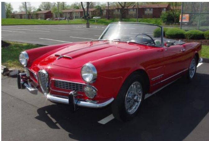
Auctions America's 1959 2000 Spider

A 1959 2000 Spider crossed the block on September 2. It was finished in the traditional red, having received a fresh repaint, and sported the original interior in black vinyl. The trim looked complete and shiny. Only two owners from new were claimed. The consignor sourced a set of Borrani wire wheels and added them in 2015. The car came with the original tool kit in remarkably good condition. The odometer showed 44,621 miles. It was sold for $118,000, well above the median price for these Touring-bodied Spiders.