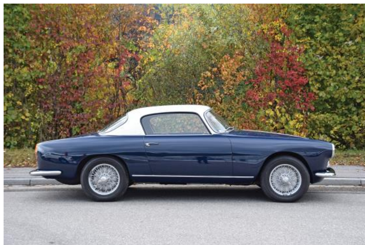
This 1900 is an auction frequent flyer.

There were several European sales in September that featured desirable Alfas. RM Sotheby's London sale was held Wednesday, September 6, and offered a 1956 1900C SS Coupe , SN 1900C10160. The Touring-bodied car was finished in blue with a gray top and a nicely patinated dark red leather interior. The car was originally sold to an Italian owner and over time migrated to Sweden. Two restorations were claimed, the latest in 2007, along with recent brake and electrical work in preparation for the sale. Although not obvious in the auction house's photos, on-site reports noted a ding in the driver side door, windshield scratches, and dried-out rubber seals.