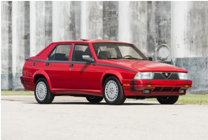
A pretty nice Milano Verde went for $13,000 on BaT.

Assuming you could find the car that you want on either site, which site is a better deal for the buyer? eBay buyers pay the amount of the winning bid. There is no buyer's premium. Bring a Trailer buyers pay an additional 5% of the winning bid, up to $5,000. Advantage eBay.