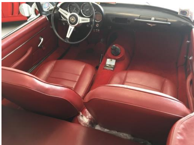
ebay 2000 Touring Spider interior

There are at least two lessons here: First, if a deal looks too good to be true, it probably is, and second, never trust a seller’s representations without verifiable evidence.