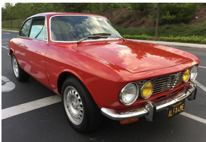
This well restored 1974 GTV sold on Bring a Trailer in August.

I write about Alfa Romeos offered at auction because there is a general interest in our cars' worth in real-life settings that produce verifiable results. Sale or no sale? How much did it sell for? It's a matter of record. In that context, writing about buying and selling on Craigslist and eBay is problematic.