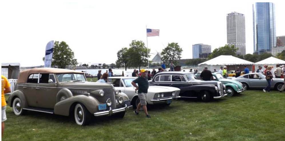
Judge's favorites grouped