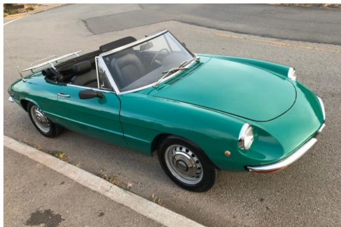
This driver quality 1969 Spider ran on BaT in August but did not sell.

But did they sell? Of the 158 Alfas offered on eBay, 34 sold, for a sales rate of 22%. Three-quarters of those cars were auction sales, while the balance were BIN sales. Of the 26 successful eBay auction sales, 9 were "project" cars, ranging in condition from "some assembly required" to moldering heaps of rust. This is one reason that the realized price for auction cars on eBay averaged only $13,685. Disturbingly, another dozen eBay cars were initially recorded as sold but then re-listed, indicating some problem with the initial sale.