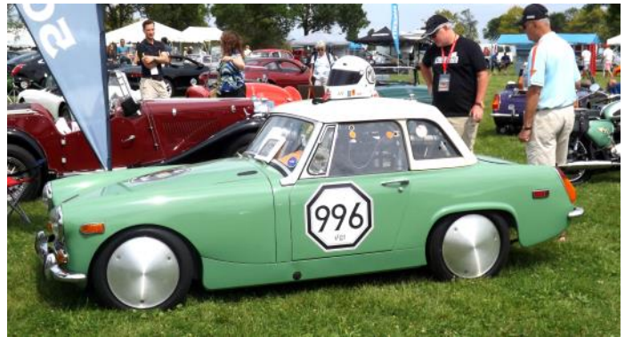
People's choice Bonneville Midget

Judges roamed the grounds and picked a favorite car from each group. The car selected from our group was an original Volkswagen Beetle. Attendees also had the opportunity to pick a favorite vehicle. The winner of the voting was a 1971 MG Midget Bonneville. It was so named as it had set a Bonneville Salt Flats record.