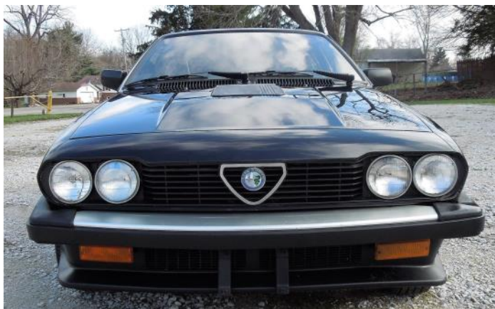
This GTV6 ran twice on eBay. Buyer beware.

The August Bring a Trailer results included a strong result for an extremely nice 1974 GTV . A west coast car with factory air, it underwent a comprehensive restoration by a California GTV specialist. It was striking in Alfa red with black Alfatex interior, came with maintenance records dating back to 1984, and had an immaculate engine compartment and underside. The extensively documented car had lost its side marker lights as most restorations do, and wore 15-inch GTA replica wheels. It sold for a healthy $76,500.