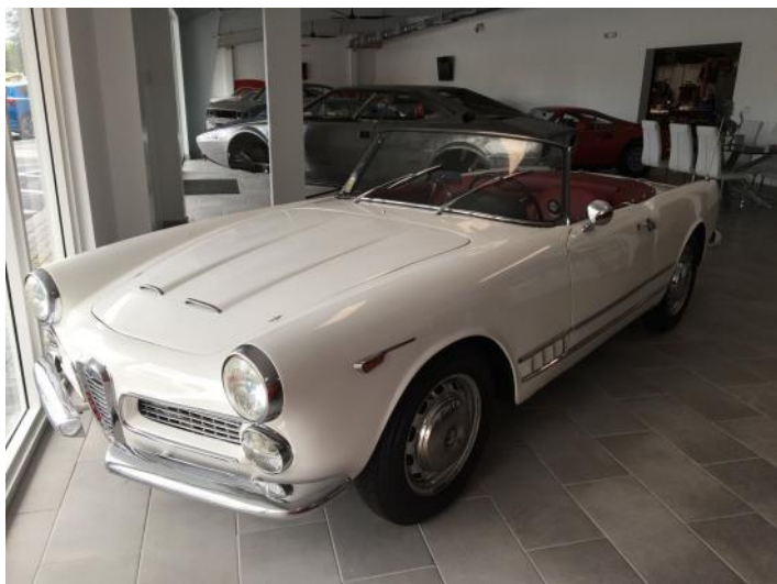
A favorable eBay outcome—an all-original 1960 2000 Touring Spider

for a high bid of $13,000, somewhat less than the dealer was hoping for but nearly double the current median selling price for a Verde.