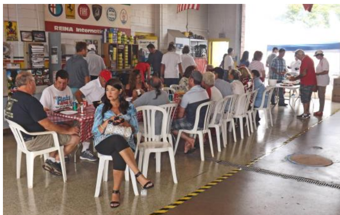
ICAMS attendees enjoy lunch