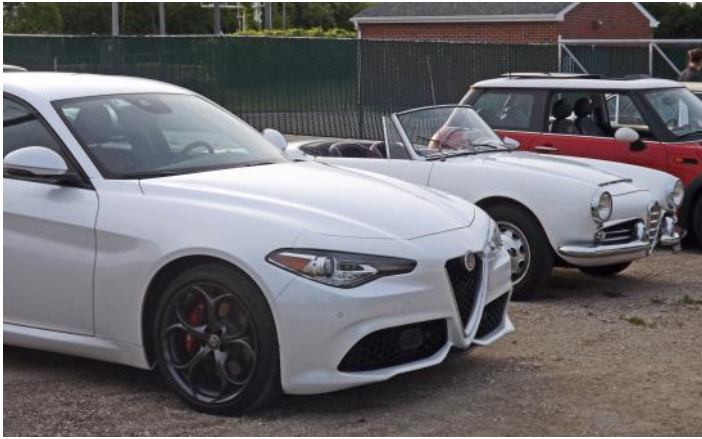
Old and new Alfas