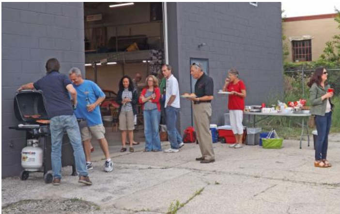
Guests grilling their dinners