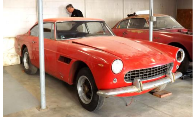
A Ferrari 250GTE with a few needs—it should buff right out.