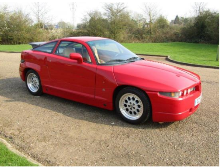
Claimed to be the only red-topped SZ

Also in the U.K., Anglia Car Auctions sold a 1991 Alfa SZ at their April 8 King's Lynn sale. SZs, the Zagato-styled coupe rendition based on the model 75/ Milano, have just become eligible for import to the U.S. as they are now over 25 years old. Our Canadian brothers have different import rules and have had access to the cars for about 10 years now. With only 1,036 built and Zagato construction, the cars are sought after by a certain segment of Alfisti and Zagato lovers.