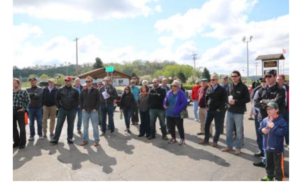
Drivers and others at the a.m. meeting.