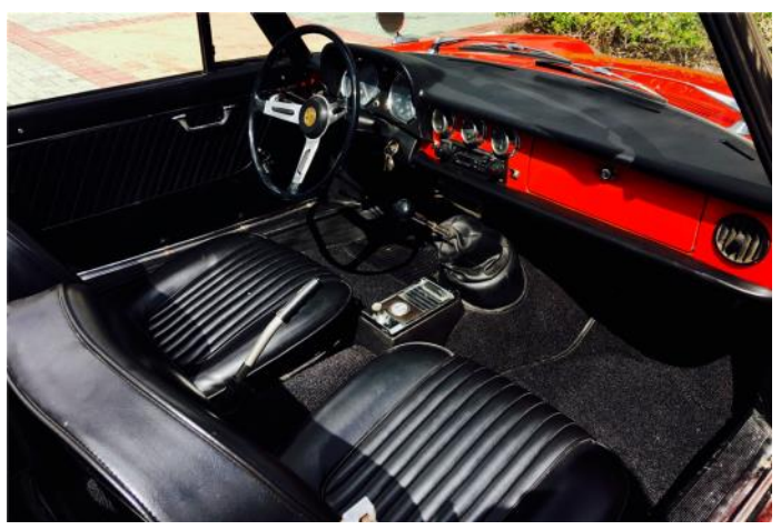
Sound Duetto Interior

The other two cars offered were seemingly identical 1986 Spider Quadrifoglios . Both were red with gray leather. The first car claimed a full restoration with fresh upholstery and soft top, but no hardtop. It sold for $19,800 on Friday, April 7. The consigner didn't own the car for long, as it was last offered at The Finest's February 11 Boca Raton sale, where it sold for $12,100.