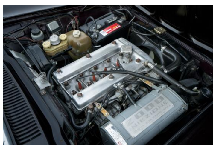
Some minor surface rust but otherwise okay

In general, everything looked tidy. Some wear was evident on the driver's seat and there was a bit of surface rust and some modern hose clamps disturbing the otherwise clean engine compartment. The exterior of the black GTV looked striking in the auction site's artistically lit pictures. Unfortunately, the shots of-