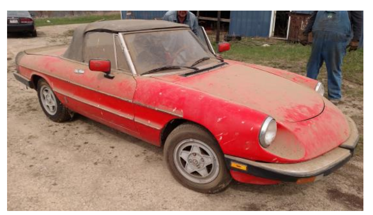
The Spider—out of the barn but not yet washed.

Disclaimer: This article has been posted as a service to our members. I have no financial interest in this car and have not seen it in the flesh. Any representations made in this article are those of the person offering the vehicle and not those of the Club or the Alfanatic.