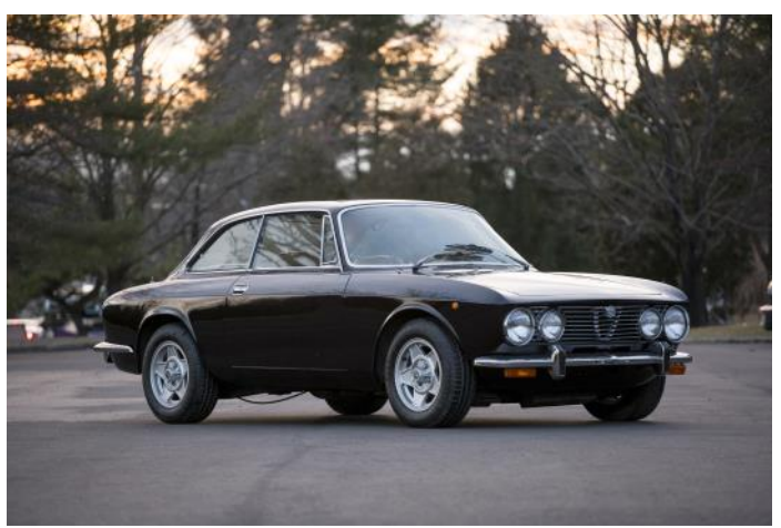
Restored black 1974 GTV

Auctions America held its Fort Lauderdale sale from March 31 to April 2. On April 1, they sold a nice looking 1974 GTV for $35,750—a fair price, possibly a bit of a bargain. But this was a situation where the information provided on the auction site was not sufficient to make a judgment—you had to be there for this one.