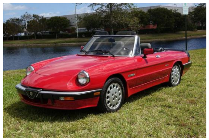
1986 Spider Quad sold for $19,800

The other two cars offered were seemingly identical 1986 Spider Quadrifoglios . Both were red with gray leather. The first car claimed a full restoration with fresh upholstery and soft top, but no hardtop. It sold for $19,800 on Friday, April 7. The consigner didn't own the car for long, as it was last offered at The Finest's February 11 Boca Raton sale, where it sold for $12,100.