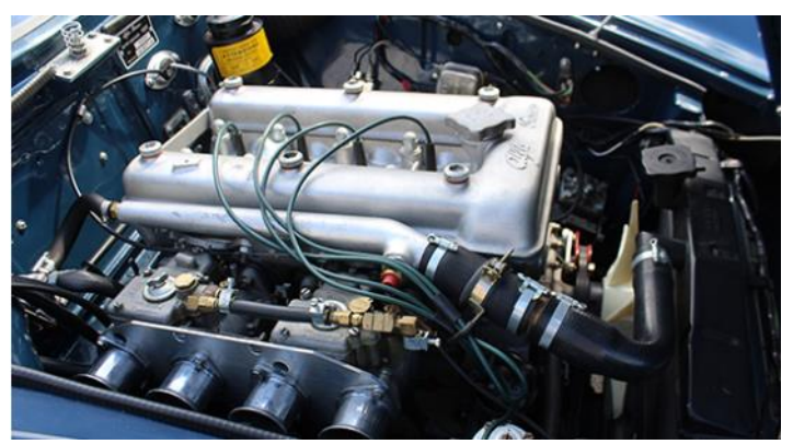
Some non-standard elements here - 1965 SS

Auctions America also offered a blue 1965 Giulia Sprint Speciale that looked very handsome in the photos provided with the sketchy description. A photo -documented bare metal restoration was claimed. The car looked complete and straight, but not completely correct, with the engine compartment lacking the proper air cleaner and carb plumbing, but with the proper style hose clamps, an interesting combination.