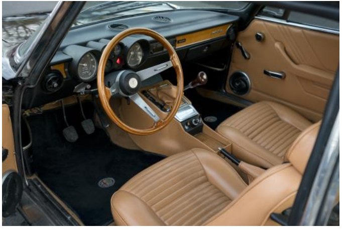
1974 GTV Interior

The seller claimed a complete restoration four years ago, with fresh upholstery and the addition of a new audio system. The car sported star pattern cast wheels and the ugly U.S.-spec corner markers had been shaved and the fronts replaced with a set of earlier round indicator lamps. The original SPICA injection was retained. The odometer showed 80,700 miles.