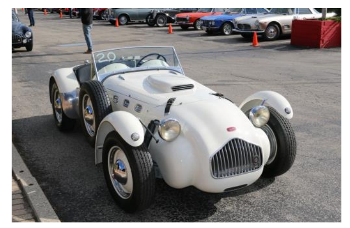
Comer's 1952 Allard J2X