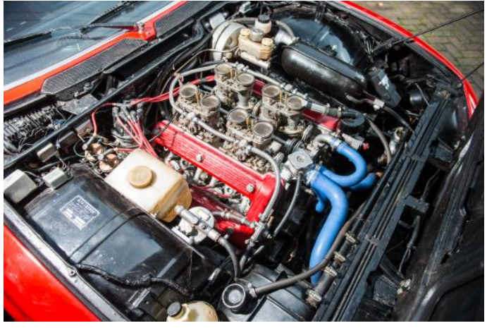
Carb'd Montreal with blue silicon hoses

The pictures showed a body that appeared to be in decent shape with shiny paint, however the auction house's evaluation indicated that it was more of a 20-footer. The interior had that lived-in look, and not in a good way, with rumpled red-trimmed black upholstery and carpeting, not in the original materials.