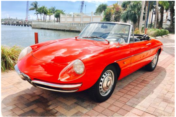
Single-owner 1967 Duetto

On Thursday, April 6, a nice-looking red 1967 Duetto, said to have been with one owner for most of its life, sold for $27,500. The driver-level engine compartment looked tidy, with signs of regular upkeep. Black carpeting was installed and a new Stayfast top was claimed to have been recently installed. Detracting from the overall appearance were the rub strips applied to the upper style line for the full length of the car. It might be tough to get these off without doing some damage.