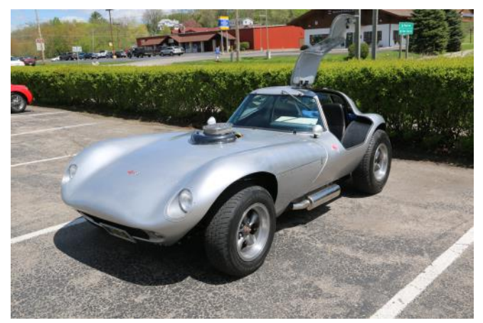
I'm not sure where this Cheetah came from.