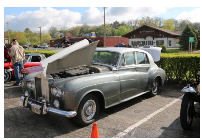
David Taylor's 1963 Rolls Royce led the comfort class.