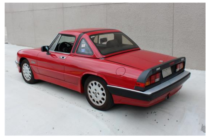
1986 Spider Quad with bad Carfax sold for $7,150

Earlier in its life, the second Quadrifoglio had been in an accident. The Carfax report documented its involvement in a rear-ender, causing damage to the right front of the Spider. The hit was not hard enough to discharge the air bags, however. Talk about diminished value! That fender-bender contributed to a 64% hit in the sale price when compared to the car sold on Friday.