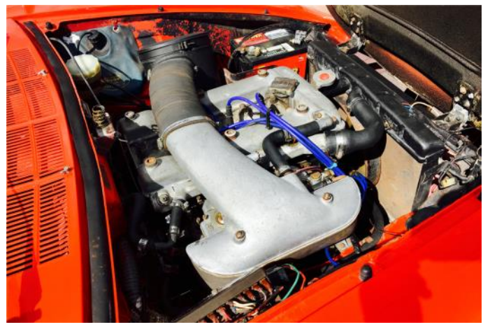
Serviceable Duetto engine compartment

On Thursday, April 6, a nice-looking red 1967 Duetto, said to have been with one owner for most of its life, sold for $27,500. The driver-level engine compartment looked tidy, with signs of regular upkeep. Black carpeting was installed and a new Stayfast top was claimed to have been recently installed. Detracting from the overall appearance were the rub strips applied to the upper style line for the full length of the car. It might be tough to get these off without doing some damage.