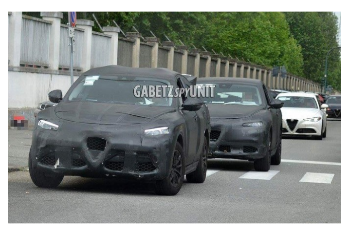
Heavily disguised prototype on the streets of Turin

motorionline.com and other sites carried the pictures captured by Gabetz Spy Unit.