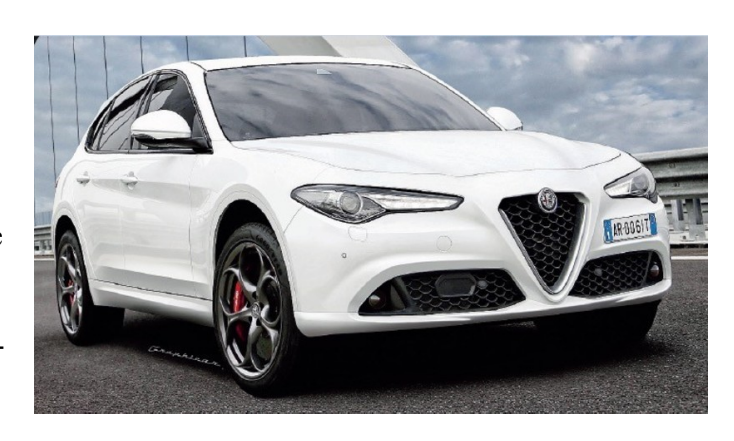
Artist's concept of the new Stelvio SUV source: <u>auto.it</u>

The camouflage does an excellent job of disguising the true outlines of the new SUV but if the artists' renderings are at all accurate, the Stelvio will make a handsome partner to the Giulia, on which it is based.