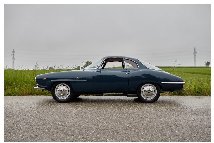
Sharp looking Giulia SS

A recently restored 1964 Giulia Sprint Speciale sold for a strong €119,000 ($131,700). Although it was originally sold to a buyer in the United States, the SS eventually found its way to an Austrian owner who with brown Leather upholstery. Aside from some questionable hoses and hose clamps in the engine compartment and some scratching on the sill plates, the car looked very nicely done—hence the very nice result.