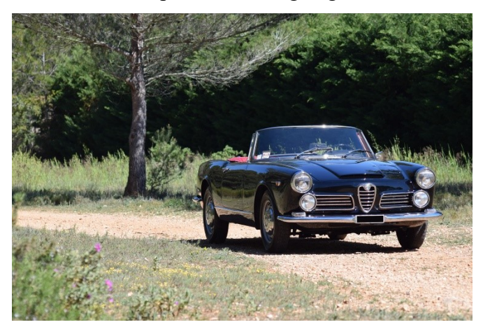
A sharp Touring Spider

A 1963 2600 Spider Touring sold for €126,352 ($139,606). The present owner commissioned the comprehensive restoration of a largely intact 92,000 km car at an expense of about $83,000. The Spider looks striking in black with red upholstery and a red hardtop, claimed to be one of the few deviations from the original configuration. The beefy six-cylinder sports Weber carburetors on what might be an original optional manifold, although the carbs themselves are of more recent production. I'm pretty sure I don't like the looks of the red hardtop sitting somewhat garishly on the striking black body, but who's going to drive the car in weather bad enough to require a hardtop anyway? Just leave the top home in the garage.