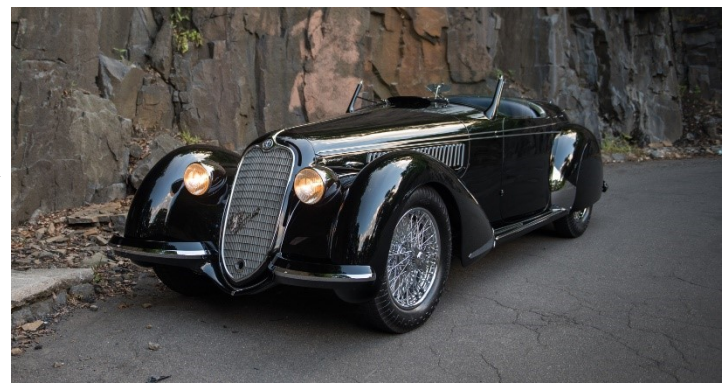
This 8C 2900 B Touring—bodied Lungo Spider is expected to sell for $20-25million in Monterey August 20.