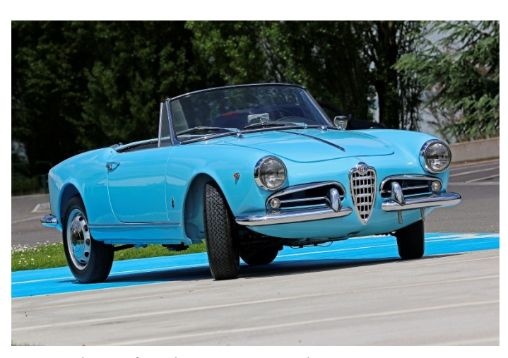
A Giulietta for show—1960 Veloce

The two Giuliettas on offer established the fact that, at this auction at least, the bidders preferred their Spiders for show rather than for go. A gleaming light-blue French-registered 1960 Giulietta Spider Veloce with black upholstery sold for €115,624 ($127,753). It was said to have benefited from a 1,500-hour restoration. It deviated from the original configuration, sporting leather upholstery in the wrong pattern and blue carpeting. The convertible top didn't look quite right, the instruments weren't restored, the carburetors might have been later Webers, and parts of the engine were painted when they shouldn't have been—all likely signs that the restoration was done by a non-specialist. Nonetheless, it was a handsome car done in an attractive color and it sold well.