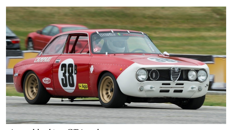
A good looking GTAm clone