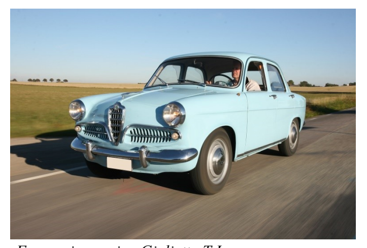
Former ice-racing Giulietta T.I.

Eight years ago French auction house Artcurial established an auction as part of the festivities. This year's 4<sup>th</sup> auction offered 115 lots that garnered €9,007,016 (\sim \$9,952,000) from a 72 percent sales rate. Five of the six Alfas offered sold for some reasonably strong prices.