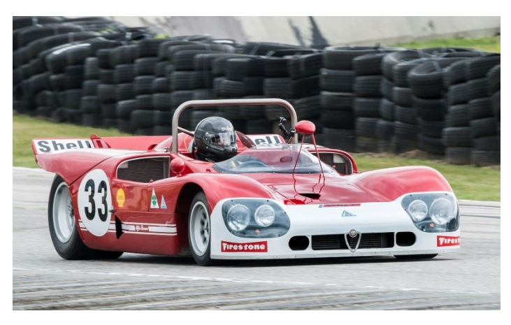
Wonderful Alfa Tipo 33 on the track