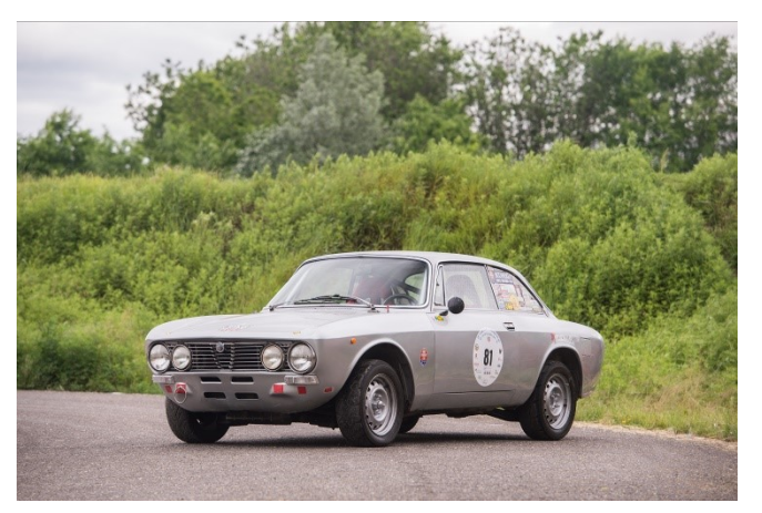
Race prepped 1972 GTV—fifth overall at Targa Florio

besting some of the hot cars of the era with what in effect was just a well-tuned road car. The GTV was offered in race trim, sans-bumpers, with multiple event decals, a roll bar, a racing interior, and the necessary FIA paperwork to allow the new owner the opportunity to enjoy this piece of rolling history. It sold for €47,680 ($52,682).