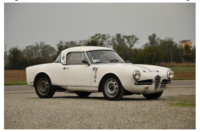
Track Giulietta was a no-go

Faring not as well was a 1959 Giulietta Spider Veloce with Italian registry. This car was an out-and-out racer, having been campaigned extensively in both contemporary and vintage racing. Participation in the 1963 San Remo Rally was claimed, along with more recent success as the 2006 Italian Circuit Champion. Since then it has seen action in other vintage race events and comes with its FIA homologa-