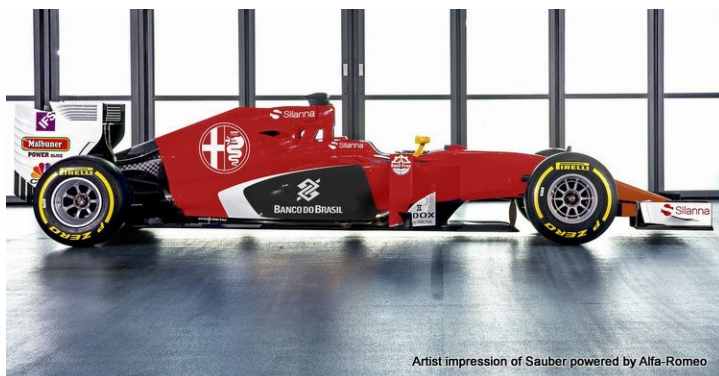
Artist impression of Sauber powered by Alfa-Romeo

Time will tell if this arrangement comes about, but expect to see something fairly soon as it seems Sauber is in big trouble and will need a cash infusion to continue on the F1 circuit this year. 🍀