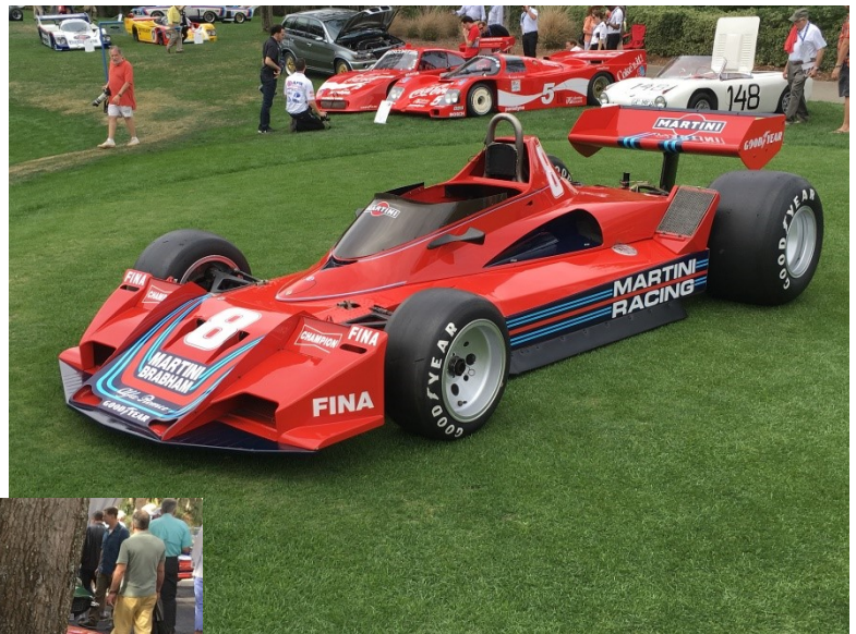
Hans-Joachim Stuck drove this Brabham-Alfa BT45B in the 1977 U.S. Grand Prix.