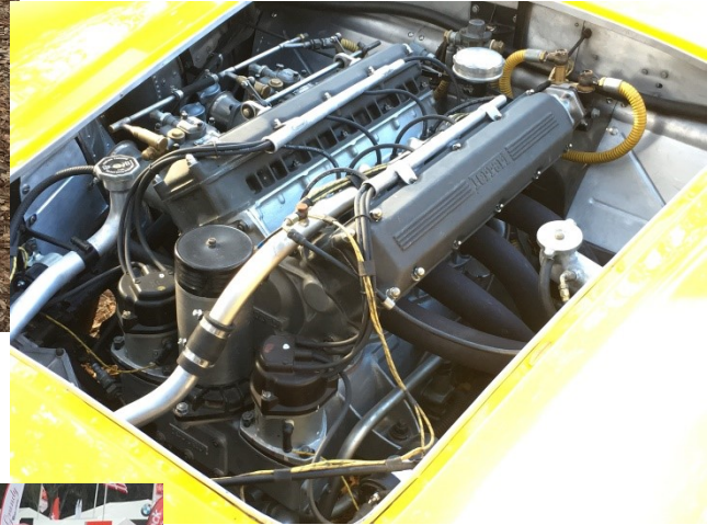
A brutal-looking four-cylinder Ferrari engine.