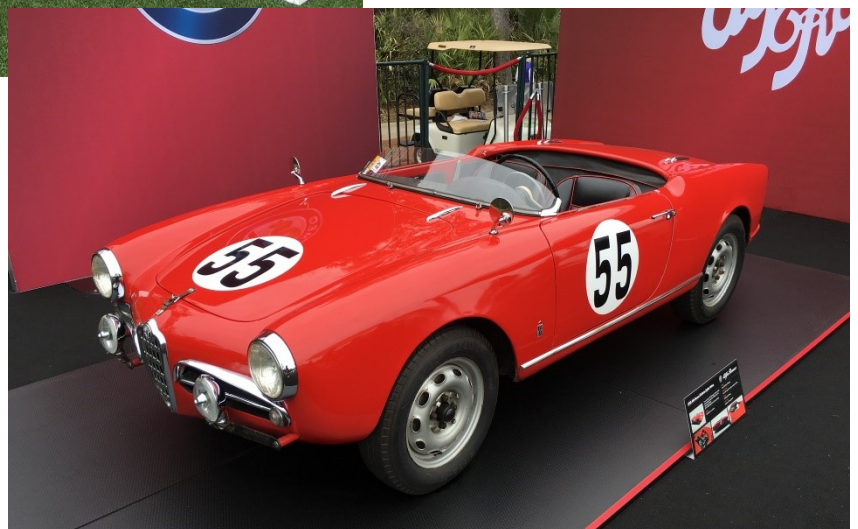
This Giulietta Veloce graced the Alfa corporate stand.