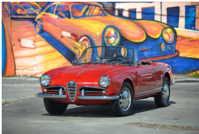
1962 Giulietta Spider, Gooding & Co.

repaint was literally so fresh the solvent was still out-gassing and there were signs of poor masking and overspray. The upholstery was said to be original and showed signs of wear. There were three owners from new.