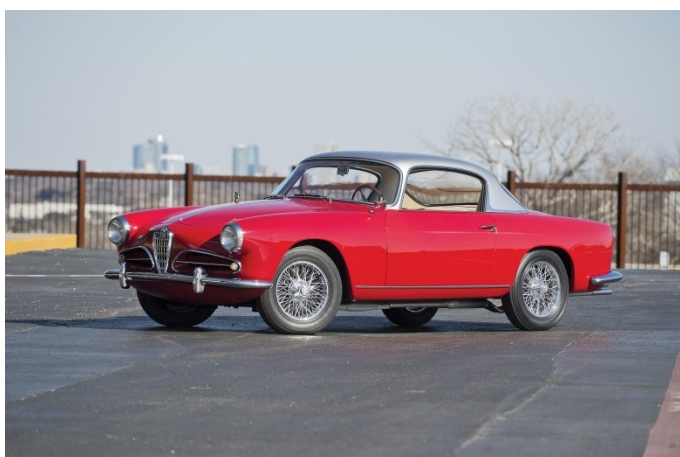
1900C SS Touring Coupe

Of the five companies doing business at and around Amelia, four had Alfas consigned. Arguably the most desirable ones were offered by RM Sotheby's. First up was a 1957 1900C SS Coupe by Touring. The two-toned red/silver car with white upholstery sold for