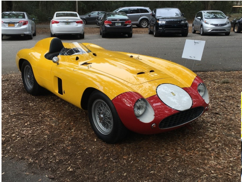
Tom says this 750 Monza was parked outside the Gooding Auction with the key in the ignition and a discrete for sale sign in the cockpit.