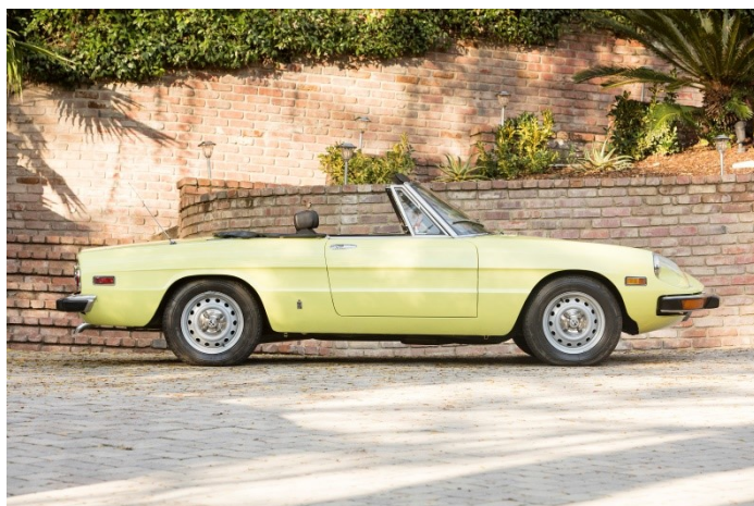
1973 Spider, Auction Frequent Flyer

Bonhams’ second Alfa offering was a 1973 Spider Veloce in yellow. It was claimed to be original and unrestored, with a single repaint in the original color, recent mechanical refurbishment costing $7,000, and 19,000 miles on the clock. The spider had but a single loving owner until 2013 when it became an auction “frequent flyer,” selling that year at the Quail Lodge auction in Monterey for $24,750. Two years later it sold for $31,900 at the same venue. This time the high bidder took it home for a reasonable sounding $19,800. So much for continual appreciation.