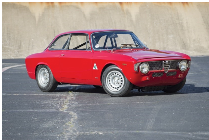
1965 GTA Stradale

The second Sotheby's offering was a 1965 GTA Stradale which sold for a strong $286,000. It was said to have been owned by the first owner for 27 years. Originally white, it was given a fresh coat of rosso corsa after moving from its early home in Brescia to a collector in Belgium in 1992. The auction description listed the fair-sized sums of money spent by subsequent owners on its restoration and upkeep. The odometer showed 70,000 well-used kilometers. Visible deviations from stock included a bolt-in roll bar with four-point harnesses and later Webers with after-market air cleaners.