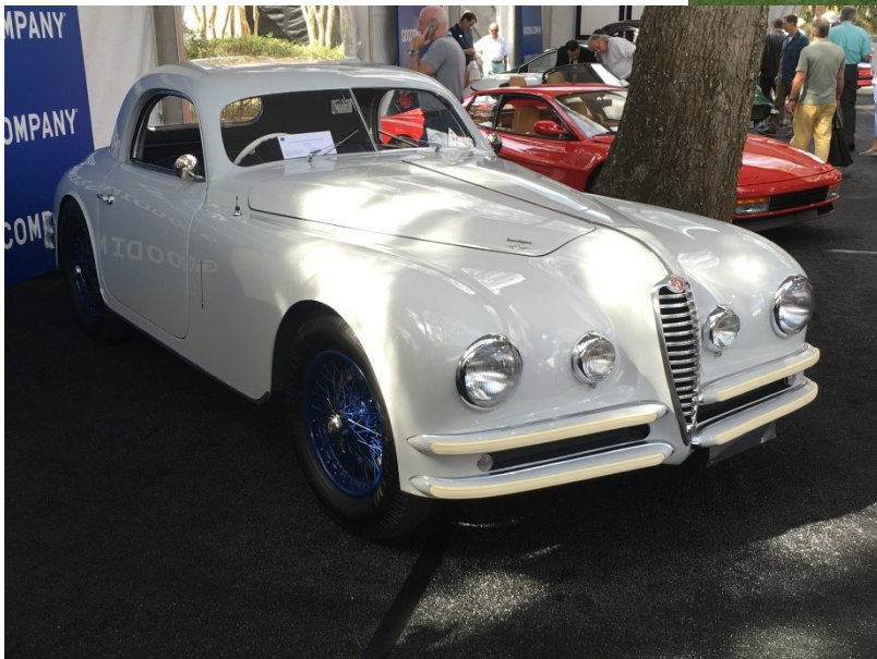
This 6C Touring-bodied coupe was a no-sale at Goodings.