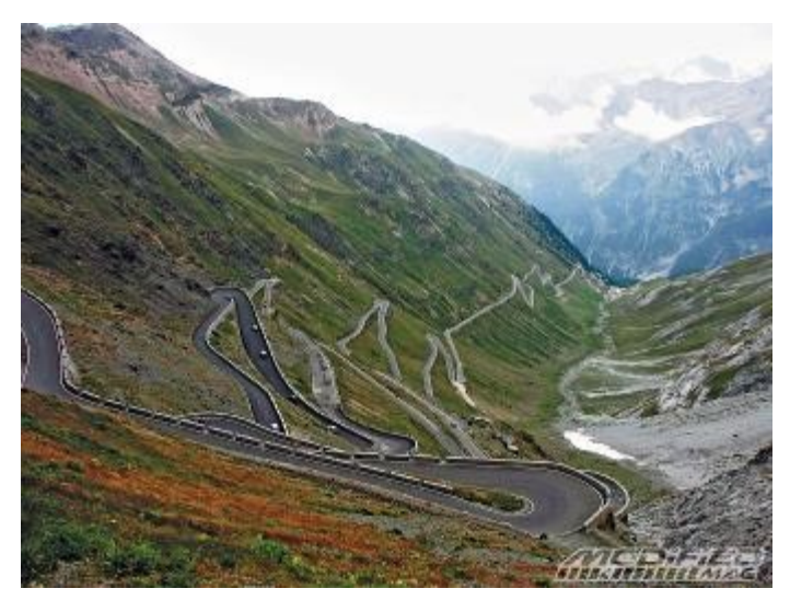
The Stelvio pass

We should see the new SUV for the first time in November, according to Alfa's boss Harald Wester, which could mean an introduction at the Los Angeles auto show. The compact SUV shares its platform with the Giulia and is expected to offer similar power options and either rear or four-wheel drive.