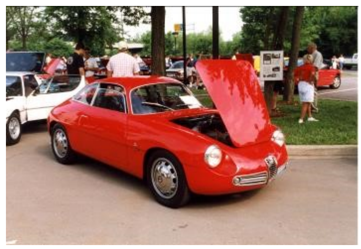
SZ #0037 in 1999

sided in the coastal city of Bari. Said to have covered only 27,000 km in its life, it sold for \notin 27,416, making the $34,995 asked for the eBay example look almost reasonable.