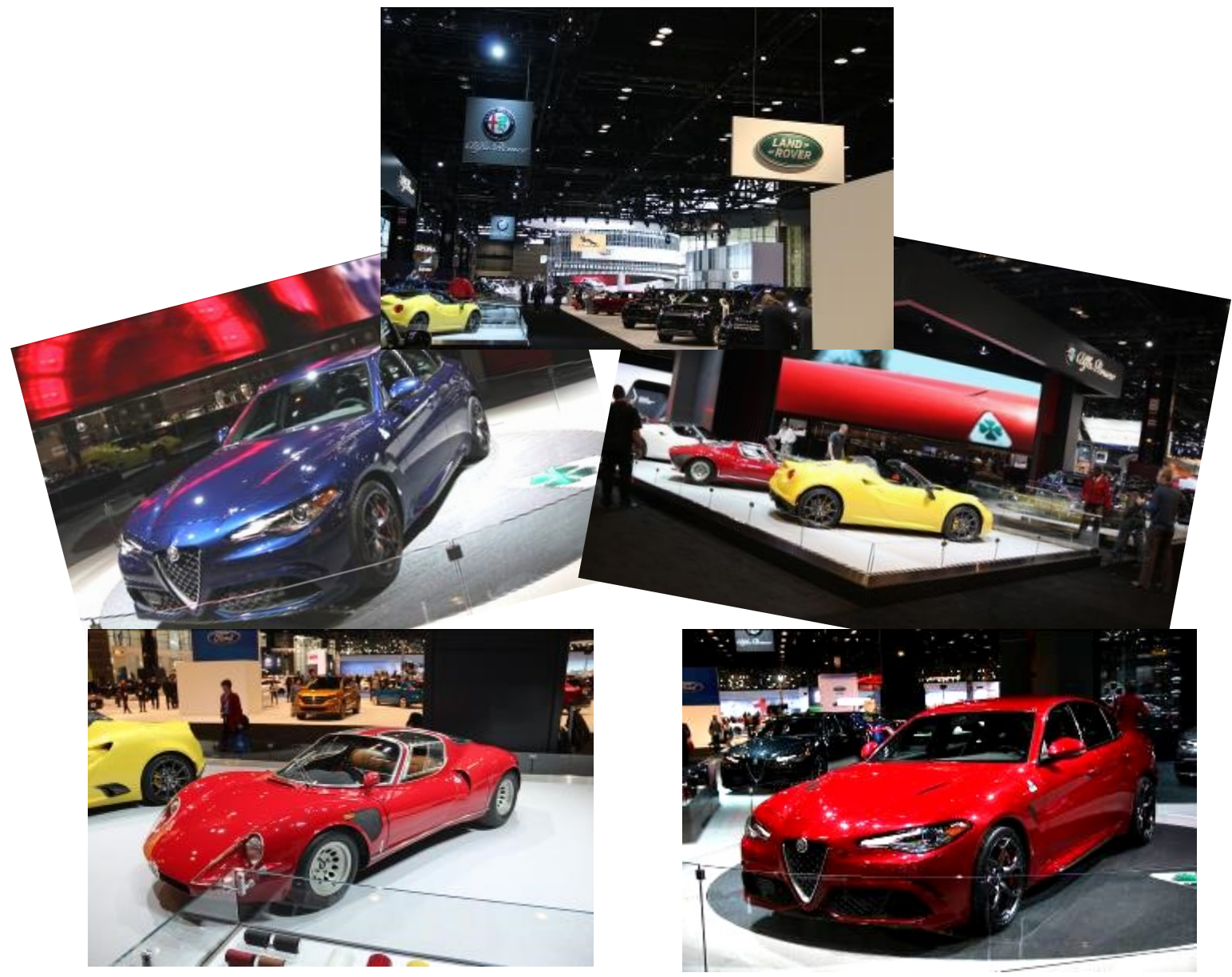
Alfa at the Chicago Auto Show

Alfa Romeo had an impressive stand at the Chicago Auto Show this year. No fewer than four Giulia Quadrifoglios were present. You could have your choice of red, blue, gray, or dark gray metallic. Of course, all were locked, so there was no seat time. All the model information was there, except for price and availability. Also shown were a pair of 4Cs, a coupe and a spider, flanking the ever-present 33 Stradale—the symbolic link to Alfa's recent past. Heck, if the boys in Arese (or wherever the Alfa brass is now) wanted a few quick sales all they'd have to do is whip up a few dozen Stradales. The line would be out the door. As handsome and modern as the Giulia and 4C are, the Type 33 was easily the most beautiful car on the stand.