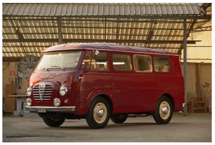
Romeo 2

Every now and then a rarely-seen item pops up at aution. At the Bonhams Retromobile auction this year, a 1961 Romeo 2 Autottuto (all-purpose) Minibus came up for bid. Think Italian Volkswagen Type 2 and you'd be close, only this van is powered by a "normale" spec. 1300cc Giulietta engine mounted up front and driving the rear wheels.