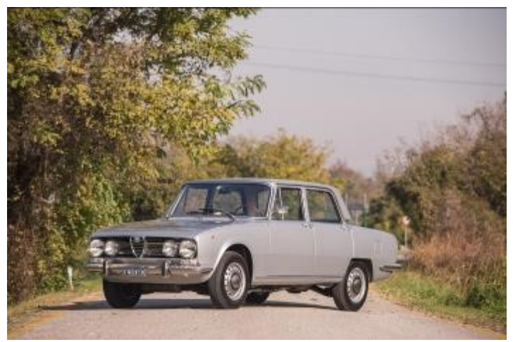
1971 Berlina

Collectors seem to have discovered the Alfa Giulia Berlina and apparently there are some wonderfully preserved examples to be mined from the back alleys of Italian hill towns. At present there is a 9,000-mile example listed on eBay and Artcurial offered a rust free, low-mileage, original-condition 1971 1750 at its February 6 Retromobile sale. The square-rigged gray sedan was said to have been found somewhere in the Piedmont region in the early 2000s and has since re-