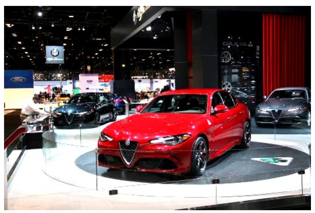
A trio of Giulia Quadrifoglios grace the floor at the Chicago Auto Show.