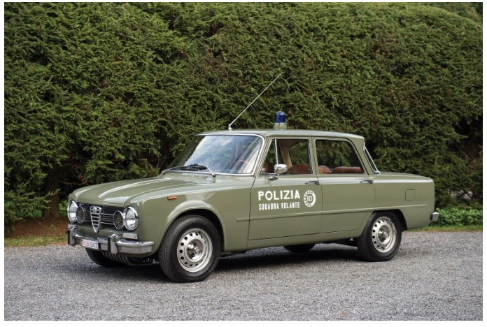
1966 Super "Polizia" recreation

At the other end of the scale, a 1966 Giulia Super "Polizia" recreation sold for a strong $33,000. It was said to have appeared in several Italian "cops and robbers" movies and sported a blue light, vintage twoway radio, and siren. While the builders may have started with a 1966 chassis, the car as presented was a "bitsa" with various parts taken from later models. The car looked handsome enough, if you like that sort of thing, but some Italian Facebook posters savaged it, calling it a "fake" and making some unkind statements about American buyers' gullibility.