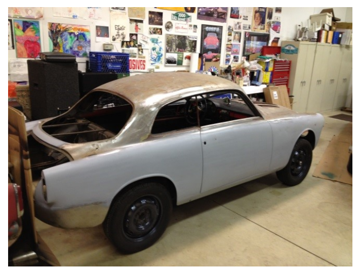
750 Series Giulietta Sprint Veloce 06881, circa 2012

Actually the car was in nice shape for a restoration candidate; the Previous Owner (PO) had started a restoration. Judging from receipts the engine has been re -built and upgraded with a 1400 kit, brakes re-done, differential/rear axle has been painted and spiffed up, seats re-covered, carpet purchased. He had stripped most of the paint off the exterior. The tough work was at the rear of the car, where at some point in its life a large hole was cut in the top of each rear fender. What the plan was for these is a mystery that will remain lost to the mists of time. Installation of two Le Mans-type fuel caps is all I can figure, so as to provide a speedy fill of the large 21 gallon Veloce tank.