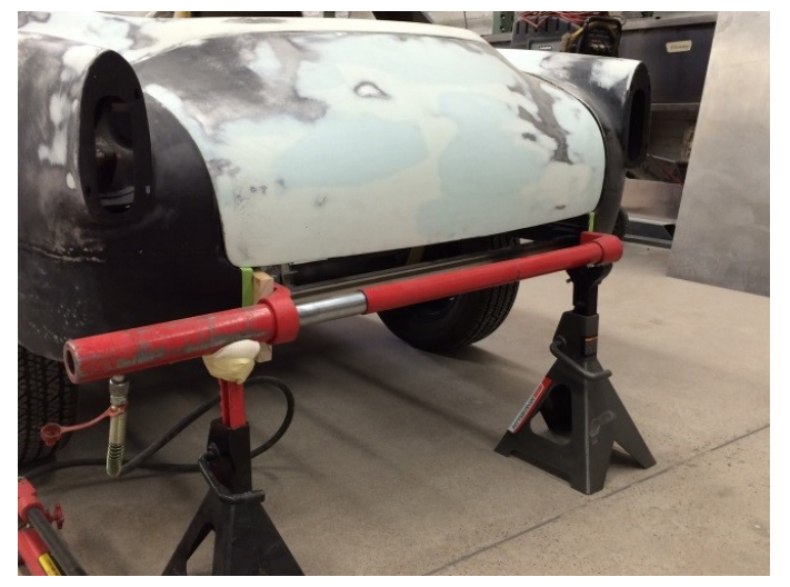
Lower valance was so poorly installed that it pulled the rear sheet metal out of shape so that the truck lid no longer fit. Valance was cut away, a stretcher used to bring the car back into shape, and then the valance panel re-installed.

one support rail. Having those allowed their use as patterns (thanks Mr. Hall for pattern labor), and my