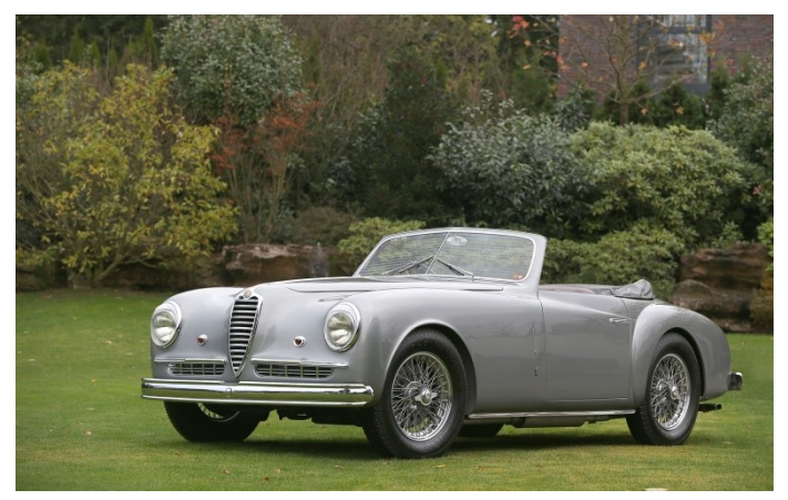
1948 6C2500SS Cabriolet

I remember stumbling across this very car during a road trip with my wife. It was in the showroom of a small central Illinois dealer located next to the Subway where we had stopped for lunch. Originally finished in cream (ivory) with black upholstery, it looked a bit scruffy as it had been in storage for quite a while. The owner wanted $35,000, the amount he needed for a small plane he wanted to buy. I thought that was a lot to pay given its condition; and besides, at the time my Alfas were used for daily transportation and I never saw these roadsters as practical cars to own. Within weeks of that encounter, the late Martin Swig purchased the car sight unseen from an ad in Hemmings and the rest, as they say, is history.