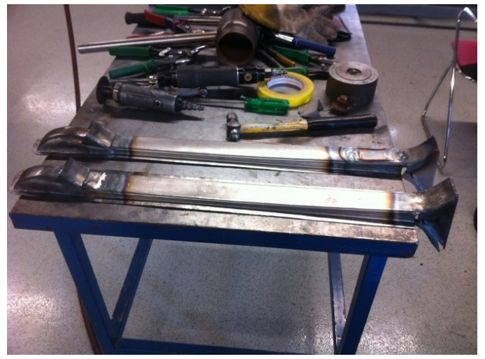
Creative bending, cutting, welding & voila! Gas tank support frames