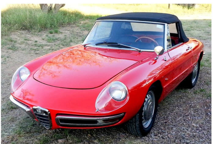
This somewhat rough 1967 Duetto sold for $27,500 at Barrett-Jackson.

With its bias toward American iron, Barrett-Jackson doesn't offer much for would-be Alfa buyers. (Only one Alfa lot, a 1967 Spider, was offered this year.) However, other auctioneers provided Alfa Romeo delights in almost every price range. This year good things came in threes as each of four auction companies offered three Alfas in their catalogs.