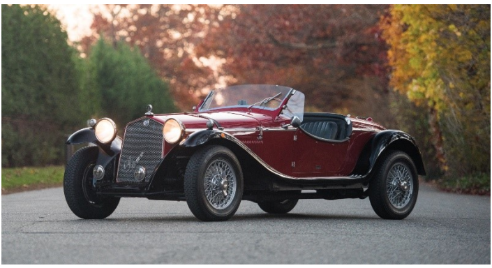
1968 Quattroruote Zagato

RM's third offering was a 1968 Gran Sport Quattroruote by Zagato, one of 92 produced between 1966 and 1968. Inspired by the original 6C1750 Zagato roadsters of the thirties, they were commissioned by Quattroruote magazine, produced by Zagato, and sold through Alfa dealers. The red retro-roadster sold for a very strong $126,500.