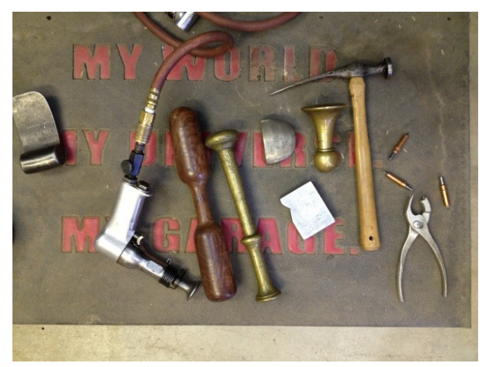
Tools of the trade for a body man. Lots of pounding and bashing is involved.

The next chapter of the saga involved the owner of the shop having a disagreement with the painter, who was cut loose from the shop. Unfortunately, the body Last year's trip to AZ was going to be the time when -man was best friends with the painter so he cut loose that trunk floor was going to be installed. Well, not too, and suddenly there were no skilled technicians so fast-there were no support frame rails from which left at the shop. Progress halted. So, the car (and to suspend the gas tank. We had the tank support hopefully all its parts) were moved from the shop straps (lucky) and the rusted front and back end of back to my brother's garage-workshop.