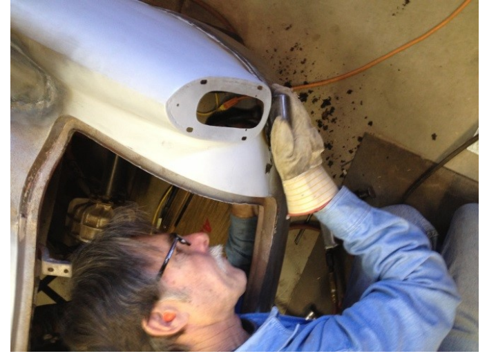
Fettling the lower valance bodge