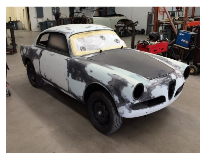
Pro body & finishing work, post "massacre"

At this point the car had been roughed into shape, but brother Rich fabricated new gas tank supports. it still had no trunk floor. Which is a pretty important component because it is what the gas tank suspends A check of an intact Sprint provided the locations for from—said 21 gallon gas tank. Plus the floor adds the support rails, and work commenced on trying to general structural integrity to the back of the car. finish the Motion Products supplied trunk floor panel. Plus, where are you going to stow the spare tire and luggage when taking a trip?