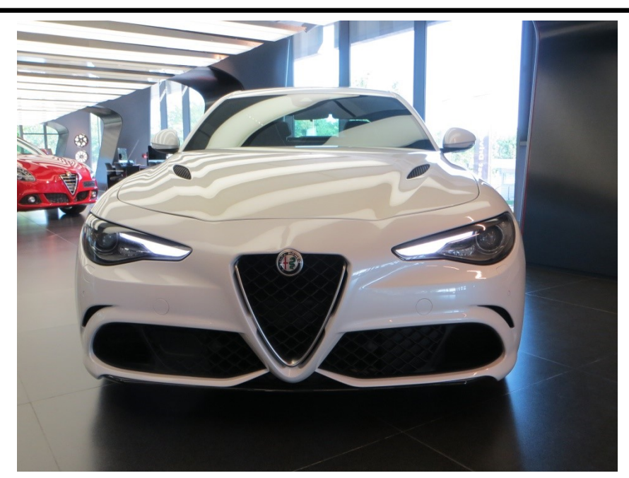
Waiting for your new Giulia to arrive? You may need to wait a while longer. Details inside.