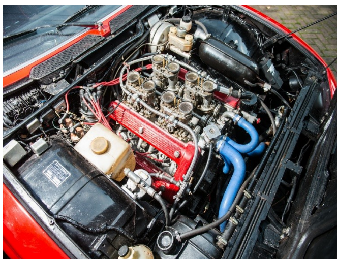
Montreal with Webers, Silverstone Auction