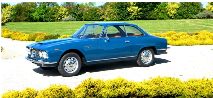
Artcurial 2600 Sprint

Another dependable Alfa auction find is the Montreal. Again, at least two were offered at auction in November, both overseas. Neither, however, found a new home. The Artcurial auction offered a nice looking 1972 Montreal, a no-sale with an estimate of €60-80,000. Originally a Swiss car, it had a recent color change from orange to red and sported a black interior. The odo showed 35,000 km and the