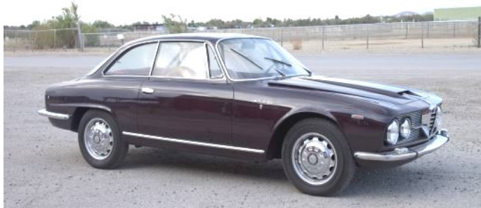
Leake 2600 Sprint

We've seen countless U.S. Coupes and Spiders with their "troublesome" SPICA systems traded for Webers but when is the last time you saw a Weber-ized Montreal? The red '72 offered by Silverstone Auctions at the NEC Classic Motor Show Sale in Birmingham, U.K., November 14, certainly meets the criteria. Estimated to sell for £34,000 – £38,000 and done up in red with black upholstery, its looks are similar to the Artcurial car. It's when you get to the engine compartment that things get kinky. The Spica injection has been replaced by four Weber two-barrels and blue silicon hoses replace the standard cooling system plumbing. Air cleaner? Not sure. It is said to be owned by a professional mechanic and has never been subjected to a complete restoration, just continuous maintenance. Other "improvements" include a Harvey Bailey handling kit. At just shy of 45,000 km, the auctioneers say the Montreal could benefit from some additional TLC. 🍀