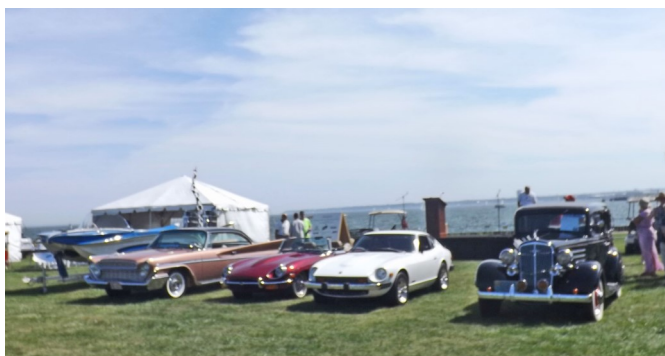
Club Day Award Winners

These were all very nice cars, with the Chevrolet being especially fine.