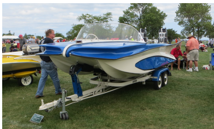
This South Seas Samoan was popular both Saturday and Sunday.

I noted several changes in this year’s show, starting with the layout, with groupings of cars clustered on either side of the main avenue which stretched southwest from the entrance to the awards dais, fronting a dramatic across-the-harbor view of the Art Museum. A marketplace section was added near the entrance, featuring, food, specialty vendors, and a selection of new autos from a number of Milwaukee area dealers, parked in a way that provided no real opportunity to show them off. Reina International Autos featured the only Alfa on the field, a red 4C LE that drew a lot of interest from show attendees.