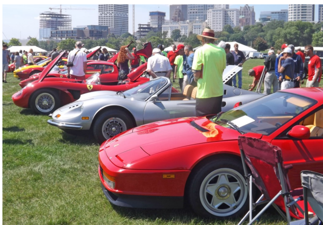
Ferrari was well represented at Club Day.

The Alfa club was represented by five cars and all presented well. The owners were kept busy answering questions from the spectators. From this reporter’s perspective, however, there should have been more Alfas, C’mon you guys, bring out your cars! 🍀