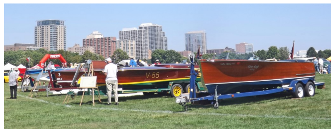
Boats shown at Club Day