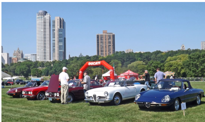
Alfas at Club Day