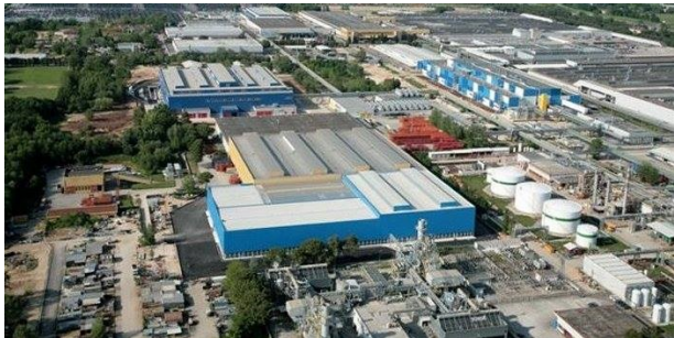
Fiat's Cassino assembly plant

IlSole24ore.com reported May 20 that assembly of the first of eight pre-production models of the new “Giulia” had been completed the previous Friday. The color? Red, of course. The eight (some sources have reported that there will be as many as 20 display models produced) will be sent to Arese for the grand introduction June 24 and following that will be on display at Expo Milano 2015.