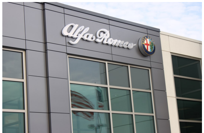
Alfa's new home in Wisconsin

Oh, the cars. They were back in the service bay awaiting their pre-delivery servicing: two gleaming and