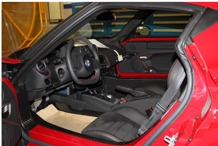
The “office”