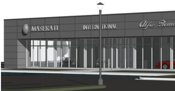
Artist's rendering of proposed dealership

The Milwaukee Business Journal reported on January 15 that International Autos Group has proposed converting the former Cadillac dealership on Arthur Ave. into a dealership for Maserati and Alfa Romeo. The site is presently used to store cars for International's Fiat and Mini franchises, but would be converted and modernized to sell the two brands. A public hearing was to be held on Feb 3 to discuss the project which would employ 25. 🍀